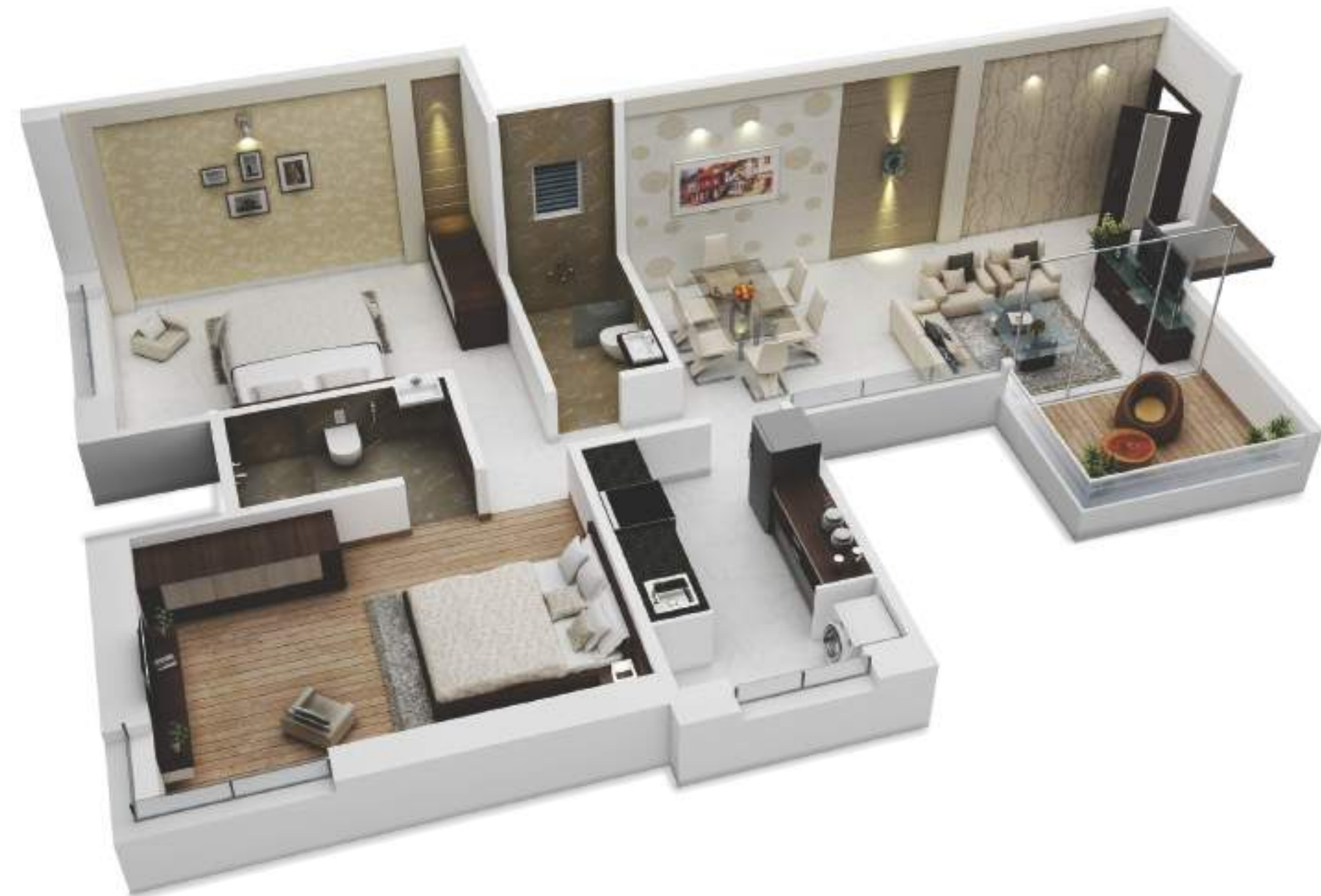
Typical 2 BHK Cut Section ▼